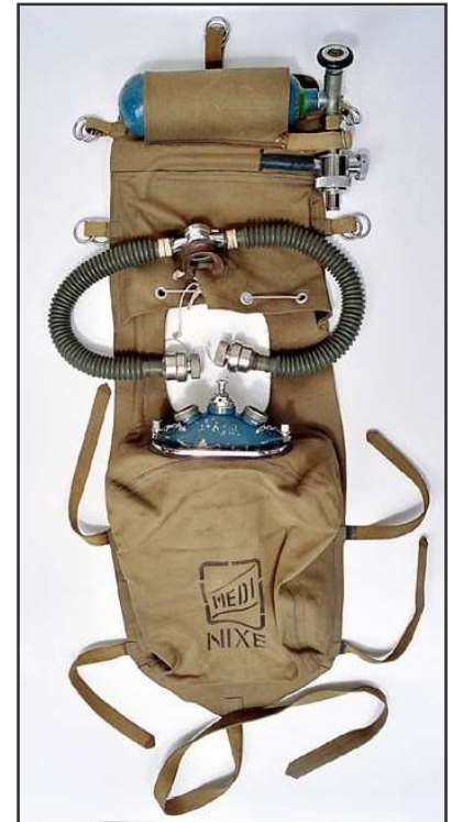
MEDI Nixe (Mermaid)

The MEDI diving gear production began in 1954 starting with the MEDI Nixe "Mermaid", a simple O2 rebreather. The initialization came from the almighty SMAD that awaited of a country with submarine escape experience (Dräger U- Boot Rescue) that they could also build O2 rebreathers. By now MEDI had developed and produced rescue rebreathers for mining and chemical industry too and the designing engineers could use these experiences. The Mermaid was produced until 1959.