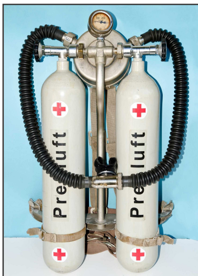
Compressed air diving app. MEDI 713

This was followed by the first SCUBA gear with a double hose regulator which was made in 1957: the MEDI 713. It was exported in small pieces to other CMEA countries