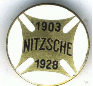
25 years Nitzsche AG, anniversary Medal

So these were more or less the traditions of making diving equipment in the GDR, more precisely in Leipzig.