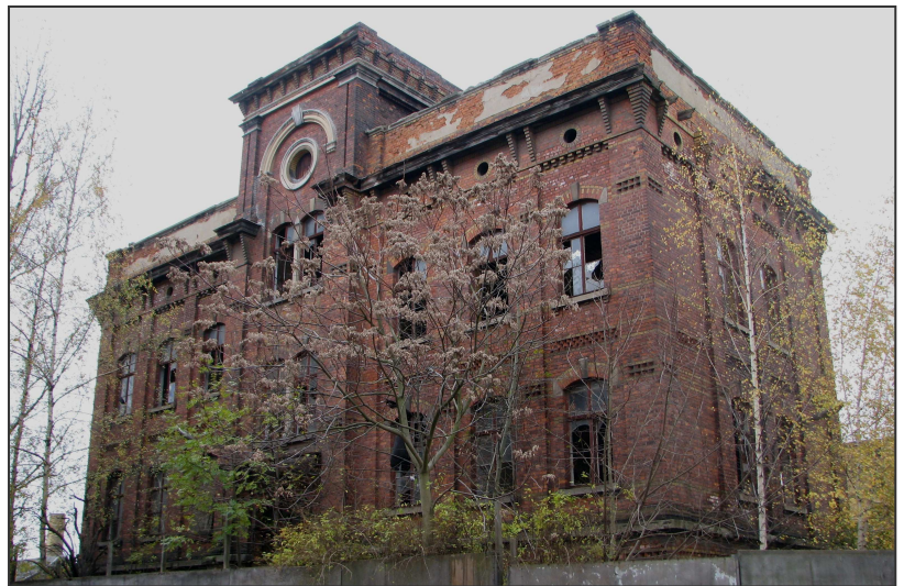
One of the MEDI buildings in Leipzig today

After the changes in 1990, the combine MLW was shattered by the "Treuhand" (Org. for handling the state-owned industry of the ended German Democratic Republic). The rest of the diving technology disappeared completely in the scrap presses. Small companies remained such as Leipzig Medicine Technology Ltd. and Medicine & Respiratory Protection. In 1999, the Fraunhofer Society, a famous research institute in Germany, gave a report commissioned by the local province government: