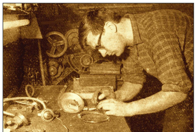
DIY production of regulators

There were also the very long development times from the idea until production launch in the GDR, due to deficiencies in technology and lack of material and also by an exuberant bureaucracy. Reverse engineering of those products already on the market, plus time delays prevented the competitiveness of the products on the world market. Immersion of MLW therefore served only for captive consumption in the GDR.