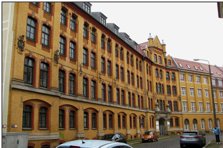
Former domicile of MEDI in Leipzig, not used today

There were however, no direct traditions in this field. The dominant manufacturer of diving equipment in Germany before the Second World War had been Dräger in Luebeck. After the division into the Federal Republic of Germany (FRG), which was also formed in 1949 from the zones of western allied forces, and the GDR, there were two different countries existing. The GDR tried to be independent from the up going West German economy and wanted / had to get along without imports from other western countries including diving equipment. This happened on one hand, for economic reasons, they had not enough