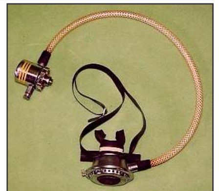
MEDI Hydromat 66

MEDI produced this family till 1974 with some light changes.