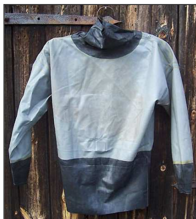
Drysuit Penguin without valves

Additionally MEDI/MLW produced cylinder valves, full face masks, the "Penguin" dry suit and other gear for professional diving.