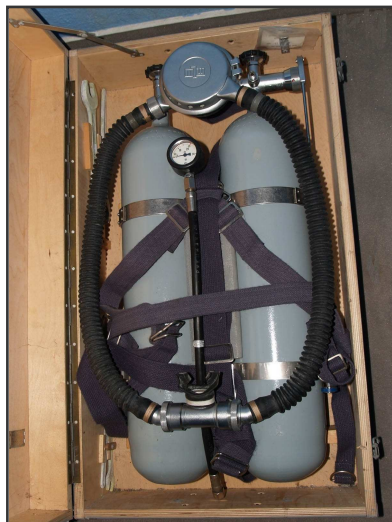
MEDI Hydromat 62028

The SCUBA lite MEDI 713 was followed 1965 by the best product of MEDI, the modular (1- to 3- cylinders) SCUBA rig "Hydromat PTG" (Pressluft- Tauchgeraet = compressed air diving apparatus), first with a two-stage double hose regulator "Hydromat 62004 G01" and from 1970 onwards additionally with the single hose regulator "Hydromat 66" (62017).